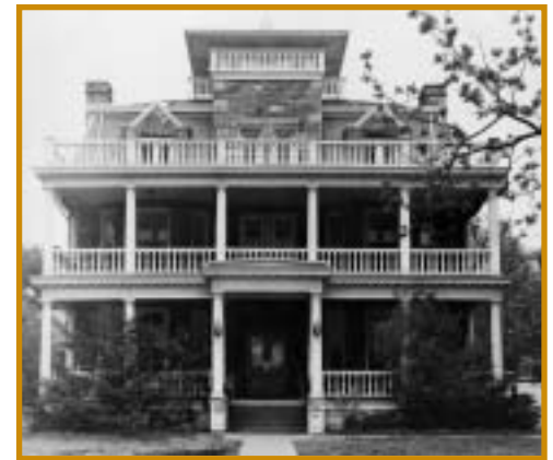
The Lutheran Home at Harrisburg

The Lutheran Home at Harrisburg was dedicated in April of 1952, serving 27 residents. Additional facilities were established on the West Shore in 1957 and in upper Dauphin County in 1961.