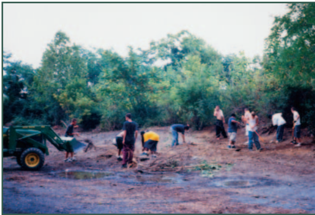
Youths from TresslerCare Wilderness Center programs contributed more than 1,200 hours of community service last year to the Capital Area Greenbelt Association in Harrisburg. Here, students from the center work on clearing ground as they continue efforts to conclude the greenbelt project, which was begun 102 years ago.

Nearly every Saturday, youths from the TresslerCare Wilderness Center near Boiling Springs can be found planting trees, spreading stone, and installing pipe in a community service project to support the Capital Area Greenbelt Association.