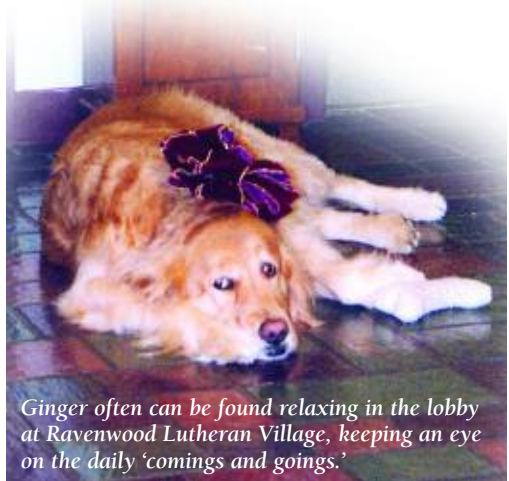
Ginger often can be found relaxing in the lobby at Ravenwood Lutheran Village, keeping an eye on the daily 'comings and goings.'

Volunteers serve in immeasurable ways, but rarely has a volunteer been able to help so much by doing so little—but that's Ginger's specialty.