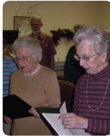
Resident members of the choir rehearse for a performance