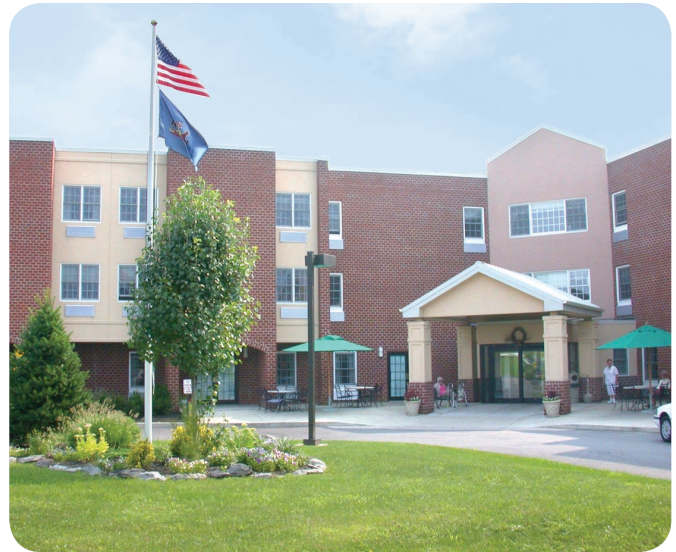
Pocono Lutheran Village, a Diakon Lutheran Senior Living Community, is located at 329 East Brown Street in East Stroudsburg, Pa.

The town's medical options also abound, according to Betsi Olmstead, manager of marketing and sales.