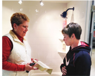
Join the fun, social atmosphere of our event team