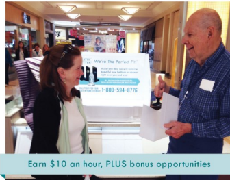
Earn $10 an hour, PLUS bonus opportunities