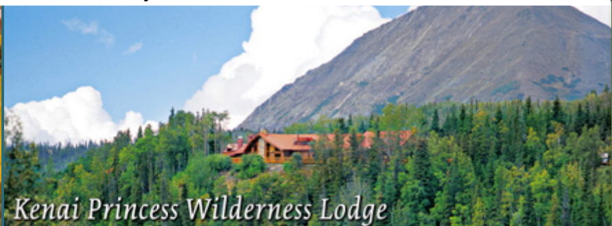
Kenai Princess Wilderness Lodge