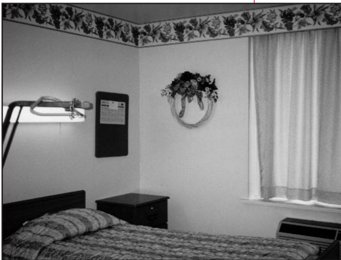
Above: In order to schedule a “makeover” for the resident rooms at Saint Luke Manor, a “test room” with new bedspreads, cubicle curtains, draperies, paint and wallpaper border was created. A beautiful result...

Also very visible will be the “makeover” of the resident rooms in Saint Luke Manor. To insure the makeovers