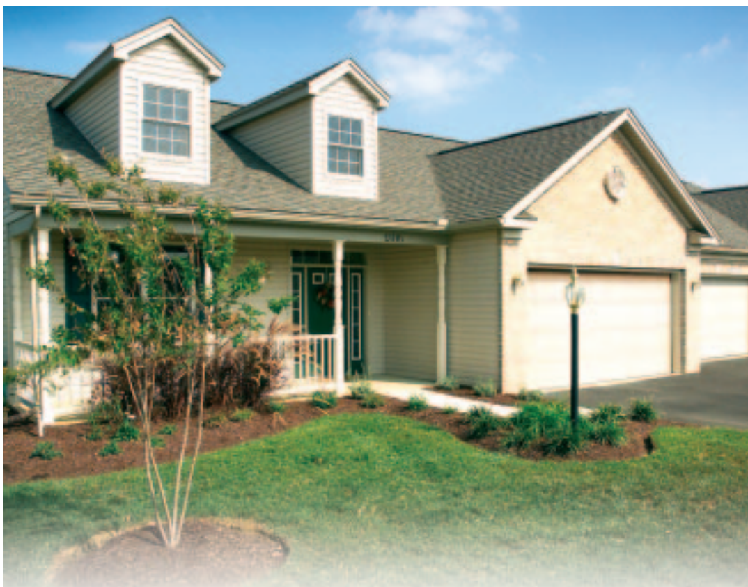
The Village at Robinwood in Hagerstown, a joint venture of Diakon and Washington County Hospital, offers both assisted living and retirement living accommodations, as well as assisted living services for those with dementia-related illnesses such as Alzheimer's disease.