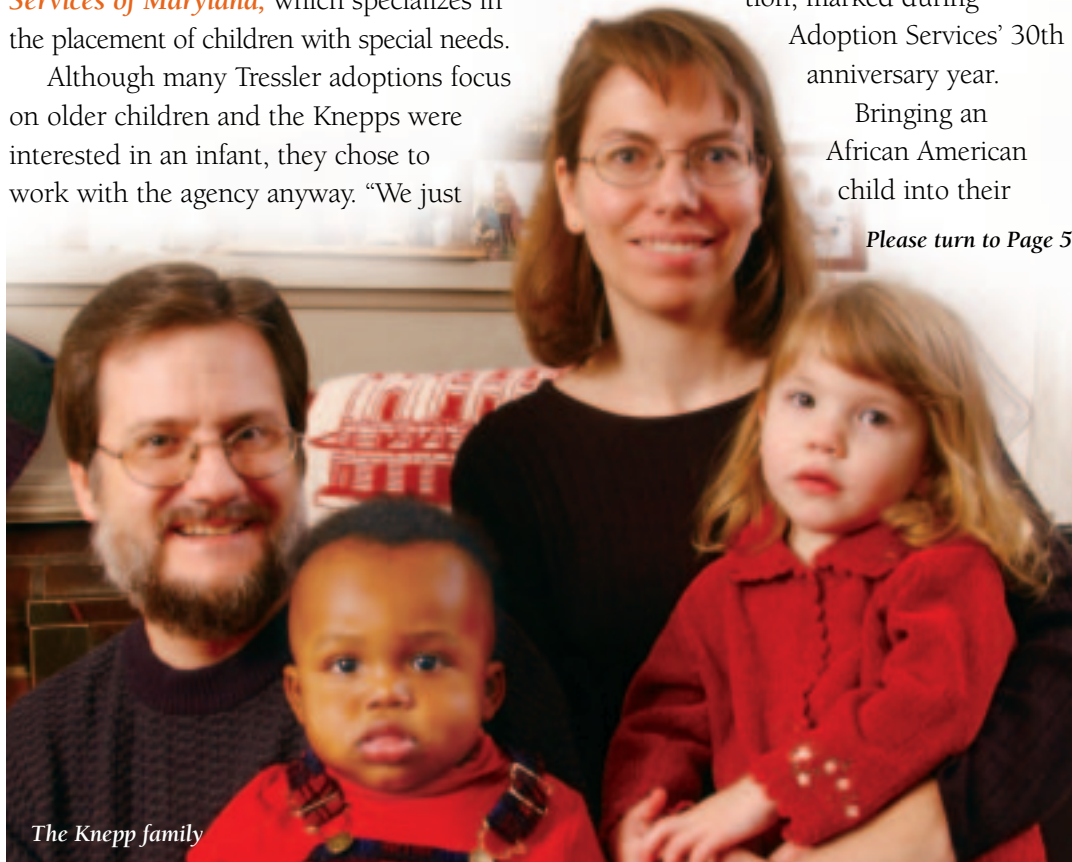
The Knepp family