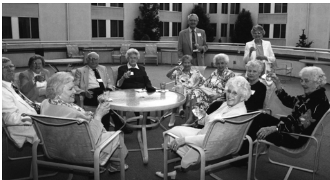
Residents from Luther Crest Retirement Village socialize on the terrace at Benefactors Dinner.