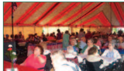
Staff, residents, and family members gathered earlier this year for a festive picnic to celebrate the 30th anniversary of Perry Village, New Bloomfield.