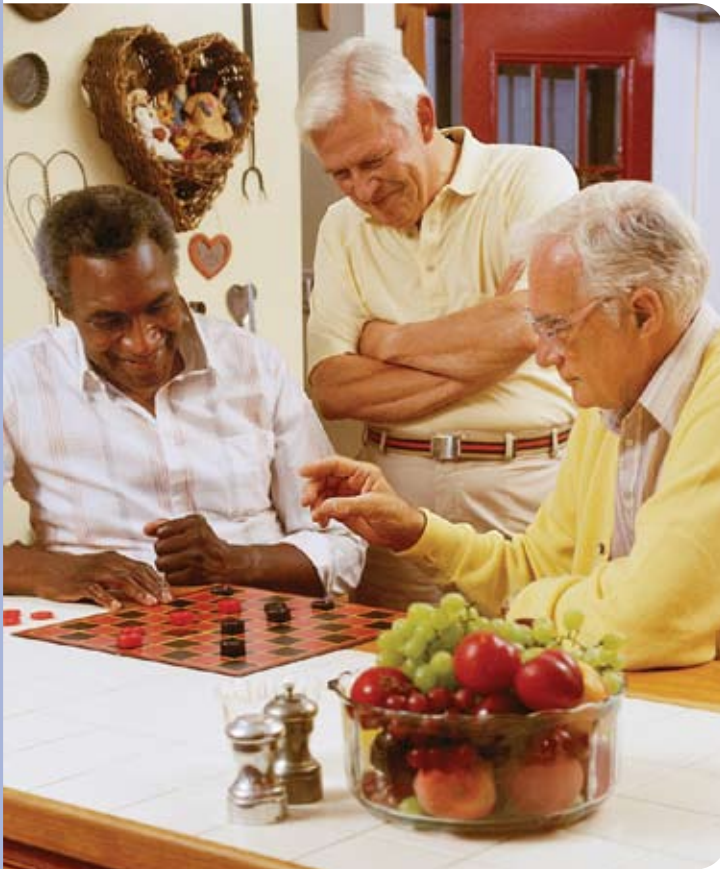
Neighbors playing a friendly game of checkers.

Seniors who remain at home have little contact with younger neighbors who are often too busy with jobs and growing families to constitute a real neighborhood. The “old neighborhood” might also not be as safe as it once was. Residents of Cumberland Crossings face each day deciding which of their life interests to pursue, surrounded by friends in a secure environment.