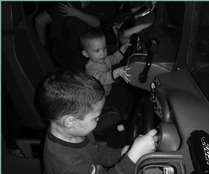
Children enjoy arcade games during Halloween Laserdome event.

This Halloween, fright-lovers got a scare and supported Diakon at the same time! On Oct. 27, Laserdome in Manheim, Pa., held a “Scream in the Dark” haunted house to benefit Diakon Adoption & Foster Care. Half of all admission proceeds were given to Diakon. Participants also enjoyed a Halloween laser show, trick-or-treating, video games, and laser tag. Youths from the Pennsylvania Statewide Adoption & Permanency Network’s Older Child Matching Initiative, who are available for adoption, were invited to enjoy the evening’s festivities.