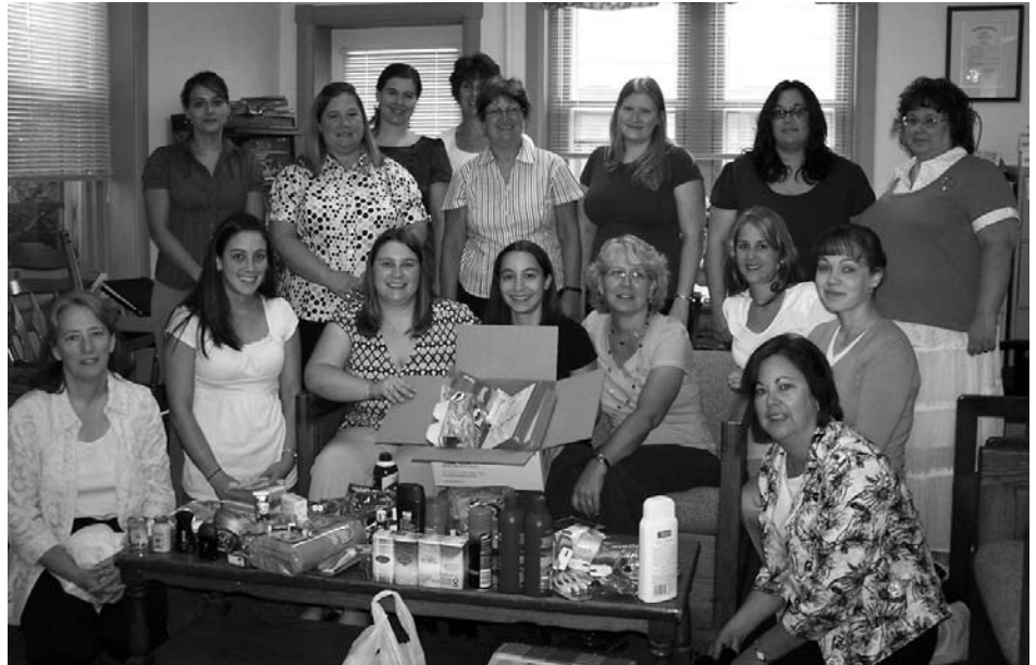
Staff come together to support soldier.