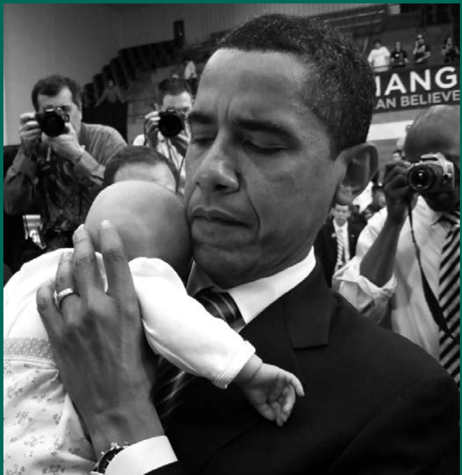
President-elect Barack Obama is pictured holding a foster child from Diakon Adoption & Foster Care during his visit to the Lehigh Valley.