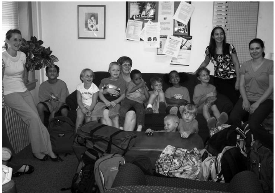
Bible School donates backpacks.

Children and group leaders from Nativity Lutheran Church's Vacation Bible School in Allentown, Pa., donated backpacks filled with assorted school supplies for the children of Diakon Adoption & Foster Care. The activity was part of the VBS "Friendship Trek."