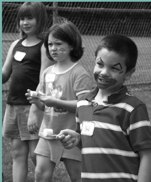
Children prepare for the marshmallow race during the family reunion.