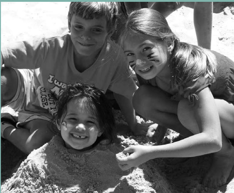
During the picnic, children played in the sandbox.