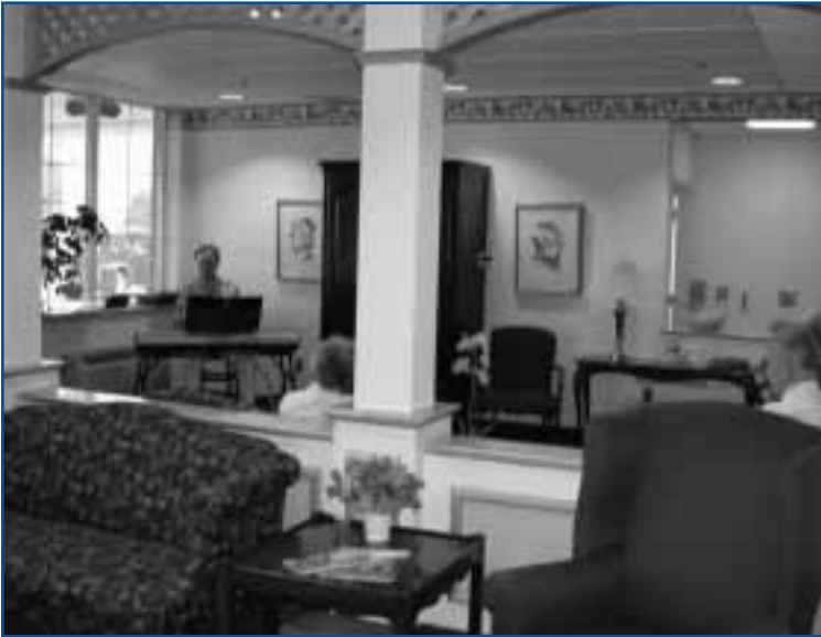
Manatawny Manor newly renovated lobby.

Hundreds of visitors got a firsthand look at new fixtures and furnishings, the bright and beautiful new lobby and main corridor, the new physical therapy and rehabilitation area and dozens of other new touches throughout the facility. Local