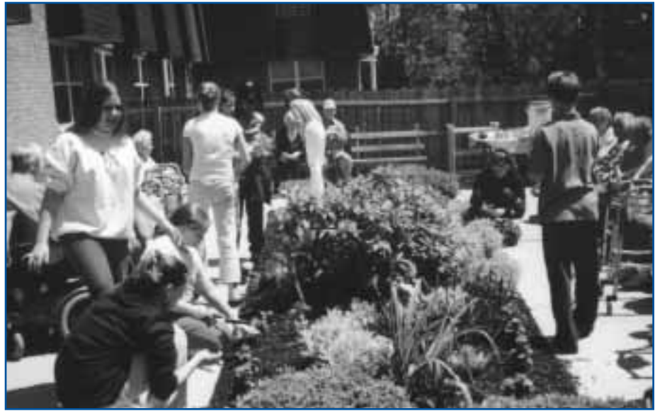
Students from Owen J. Roberts Middle School plant and weed the "Secret Garden" while residents assist and supervise.