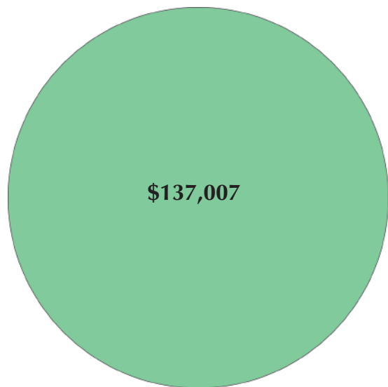
2010 Benevolent Care at Twining Village: $137,007

■ Care for Those Who Have Exhausted Financial Resources