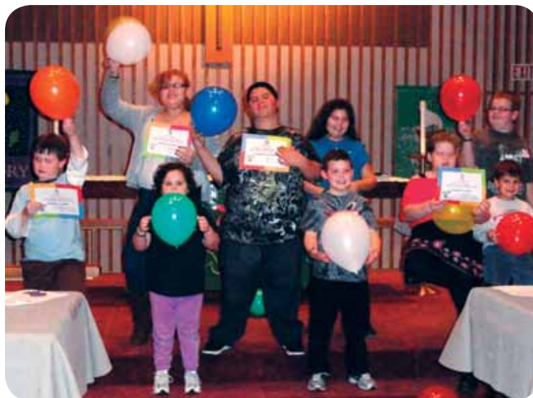
After nine weeks of hard work amending bad habits and adopting healthier ones, these students celebrate their confidence to put into place the tools and strategies they learned at KidShape.

In the late 1980s, a California-based pediatric endocrinologist recognized the increase in the number of overweight children and decided to do something about the problem. She, along with colleagues, established the first program using the power of the entire family to bring about permanent change in overweight children. They called it KidShape®.