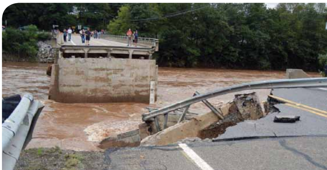
This bridge in Lycoming County was completely washed out by Mother Nature’s fury.