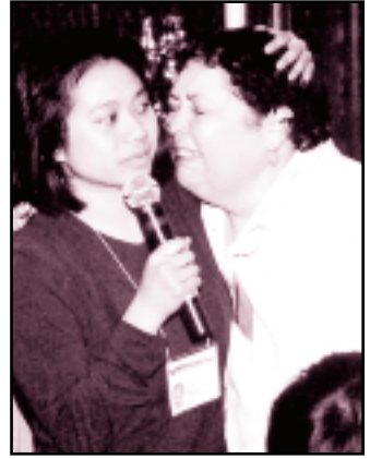
A mother and daughter at the reunion