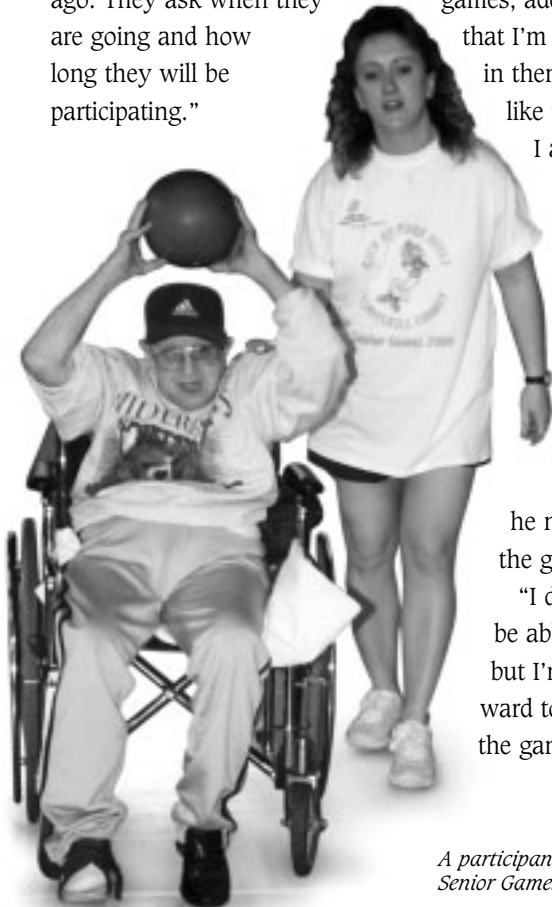
A participant in the Schuylkill Senior Games aims for the basket.