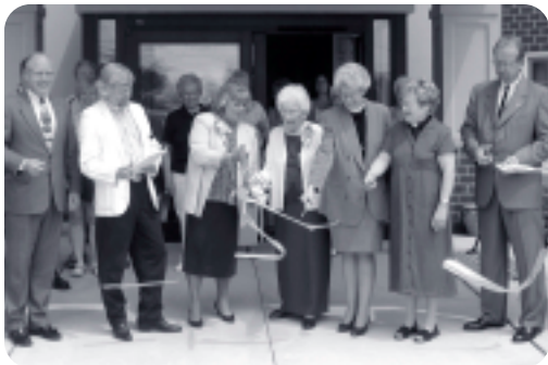
Pocono Mission District, Northeastern Pennsylvania Synod, and Diakon Lutheran Social Ministries officials, as well as a village resident, cut a ribbon marking the dedication of Pocono Lutheran Village in East Stroudsburg, Pa.