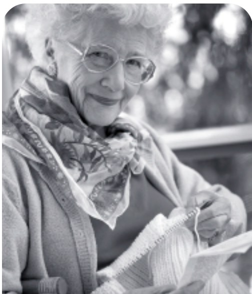
Viewing each person we serve as a unique gift of God is at the root of Diakon's faith-based care.

Because we respect all people as gifts of God, we treat all people fairly and justly regardless of their individual persuasions or lifestyles. "In response to God's love" is why we offer service.