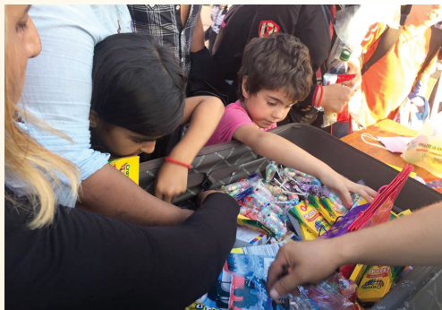
Syrian children from refugee families are treated to coloring books and crayons.