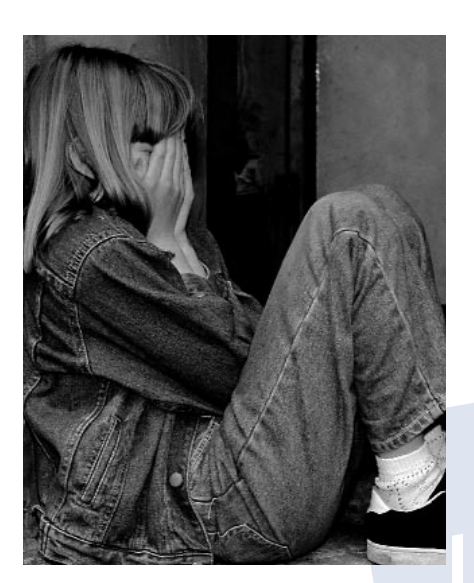
Children suffering from the emotional effects of the death of a loved one are being helped by new programs offered by Hospice Saint John.

Based on that success, Hospice Saint John recently developed an in-school program for area elementary, middle, and high schools. Held an hour a week for six weeks, the program includes topics such as emotions and finding supportive systems, but it's far from traditional counseling.