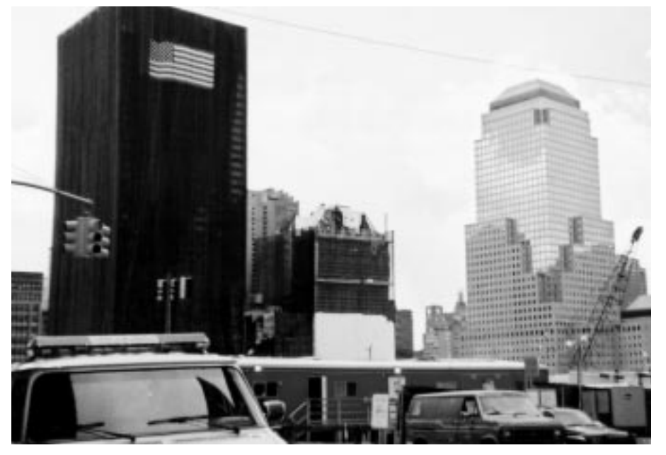
The Diakon Lutheran Social Ministries staff members took this photograph of the altered New York City skyline in the area of Ground Zero.

While everyone was assigned to a congregation for Sundaymorning services, those who made the trip also participated in a joint