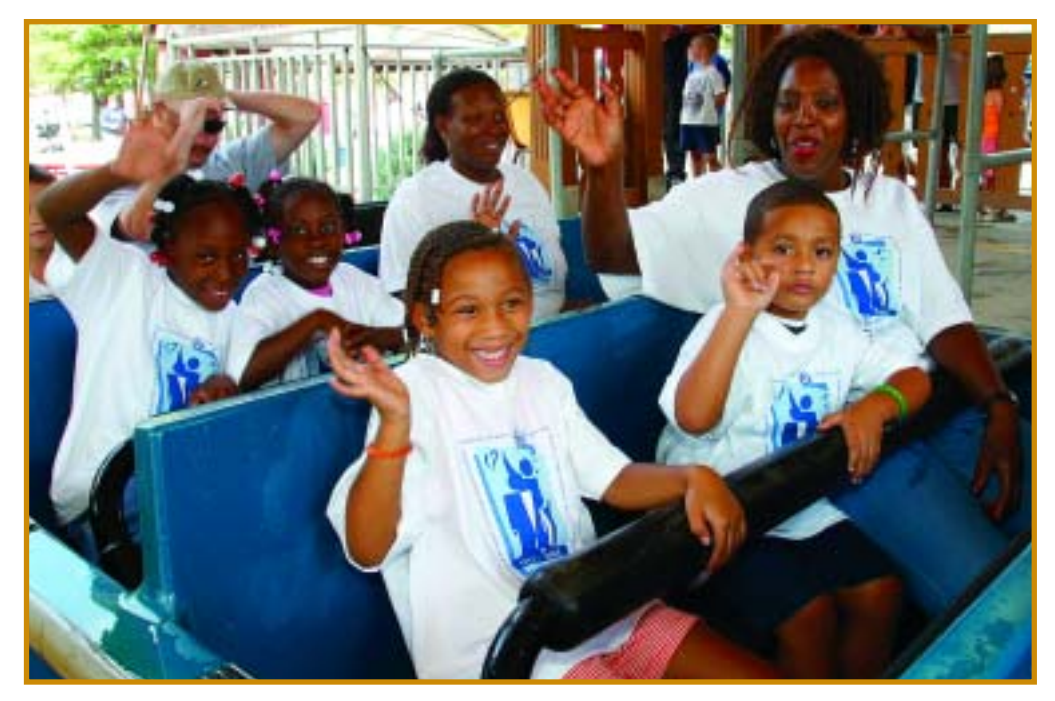
Adoptive families from Pennsylvania and Maryland were treated to a day in the park at Knoebel's Amusement Resort in Elysburg, Pa., as part of Diakon's celebration of 30 years of adoption services.