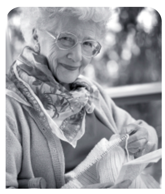
Viewing each person we serve as a unique gift of God is at the root of Diakon's faith-based care.

But this first phase has been critical, because it speaks to the foundation upon which all