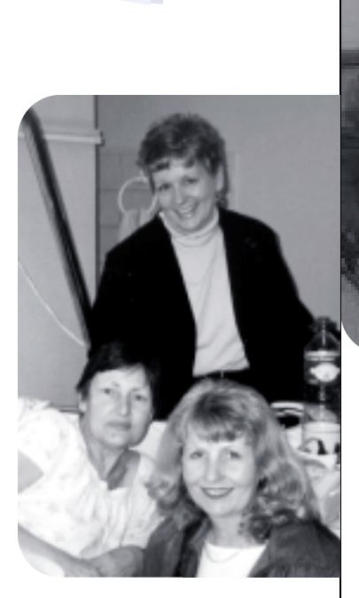
There's No Place Like Home!