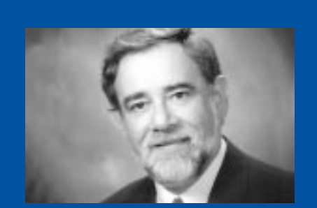
President's Dialog Page 2